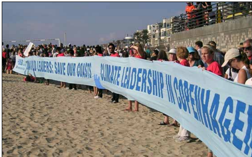
Hundreds of people turned out for the South Bay's observance of the International Day of Climate Action on Oct. 24. About a dozen PVP Democratic Club members joined a human chain stretching northward from the Manhattan Beach pier to create the "Amazing Waving Human Tide Line." The line of people was positioned on the sand where the tide line is predicted to rise if carbon dioxide levels in the Earth's atmosphere keep increasing above the safe 350 parts per million limit.