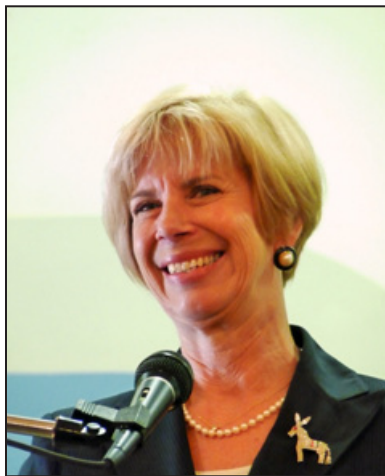
Janice Hahn, Candidate for LT. Governor