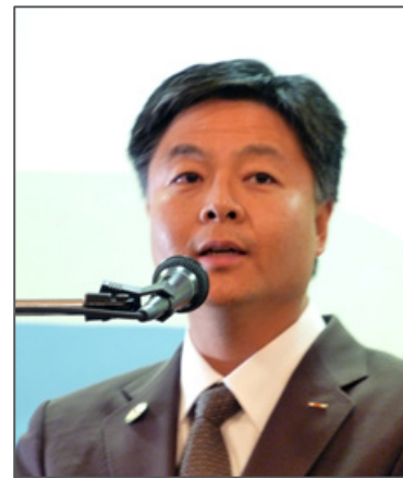
Ted Lieu, Candidate for Attorney General

Torlakson went on to say that some charter schools are not performing well and all are robbing neighborhood schools of funding.