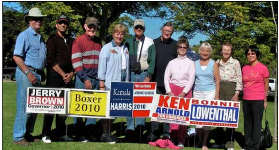
Some of the PV Democrats who volunteered to work for our candidates during the fall campaign

In addition, we will now hold our annual membership meeting in July instead of January.